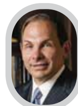
Bob McDonald 8th Secretary, Department of Veterans Affairs, Retired Chairman, President and Chief Executive Officer, Procter & Gamble